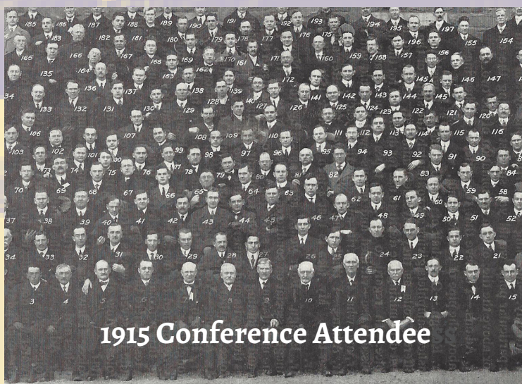
1915 Conference Attendee

The second major conference on Good Roads wasn't held until 1915 when the event was moved to the Cornell College of Civil Engineering and called a " Good Roads Week ." The conference now included a research focus and remarks from NYS transportation officials and the University President.